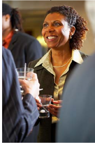
How Are You Improving Morale?